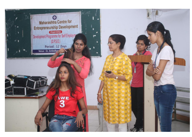
Make- up and Hair-styles