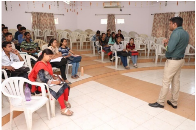
Guidance on Business Opportunities and Business Management.