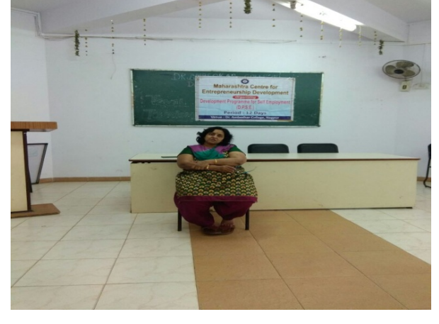
Guidance on Tours and Travels Business